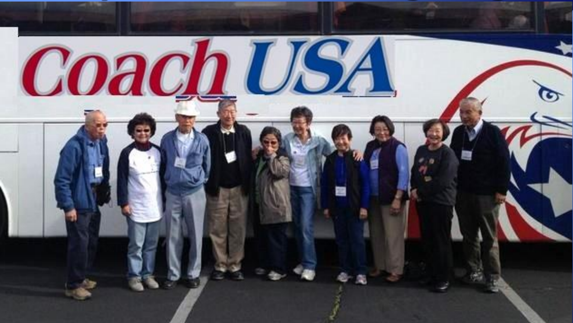
WWII Camp Survivors at the Manzanar Bus